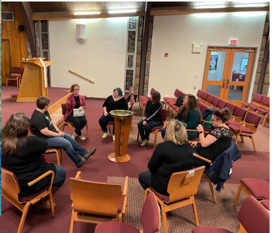
Board members gather for worship during their November retreat